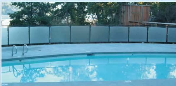
With Heatsavr, 15 minutes later